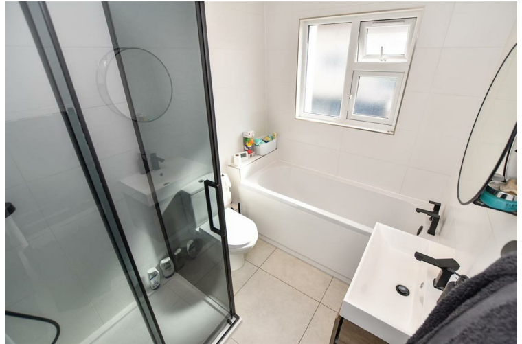
Bathroom 8'0" x 6'1" (2.44m x 1.85m)

Obscure upvc window to side aspect, smooth plastered ceiling, tiled flooring and walls, underfloor heating, spotlights, vanity unit with inset wash hand basin and matt black mixer tap, shower cubicle with tinted glass door and black handheld and waterfall shower heads, panelled bath with matt black mixer tap, matt black heated towel rail, dual flush W.C.