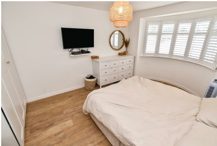
Bedroom Two 11'5" x 7'1" (3.48m x 2.16m)

Bay window with shutters to front aspect, smooth plastered ceiling, laminate wood flooring, underfloor heating, tv and power points