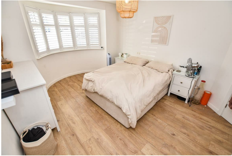
Bedroom One 16'0" into bay x 11'2" (4.88m into bay x 3.40m)

Bay window with shutters to front aspect, smooth plastered ceiling, laminate wood flooring, underfloor heating, tv and power points